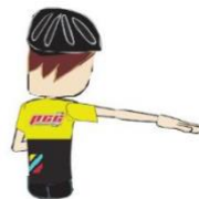
RIGHT TURN Arm out straight and pointing in the direction of turn.