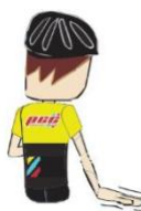
SLOWING Wave/pulse one hand as if patting a dog.