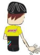
GRAVEL Indicate glass or loose gravel by shaking your hand, palm down on the side where the hazard is.