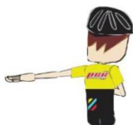
LEFT TURN Arm out straight and pointing in the direction of turn.

When pointing obstacles out never remove your hands from the bars at the risk of your own safety.