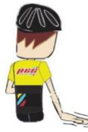
SLOWING Wave/pulse one hand as if patting a dog.