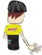
GRAVEL Indicate glass or loose gravel by shaking your hand, palm down on the side where the hazard is.