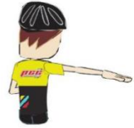
RIGHT TURN Arm out straight and pointing in the direction of turn.