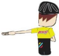
LEFT TURN Arm out straight and pointing in the direction of turn.

When pointing obstacles out never remove your hands from the bars at the risk of your own safety.